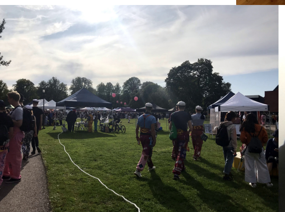
Aalto Party with booth of different student bodies