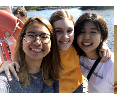
Outing and lesson with the kids from Russia

It was a busy month started with the orientation activities including Aalto Party, Welcoming Event and orientation organized by the school to prepare you to adapt the life in Aalto. Since I only studied two courses this period, school life was relatively relaxing. I enjoyed cooking with my flatmates and friends e.g. dumpling night, Korean night. There was a marathon in late-September that Aalto students can join for free. Should grab this chance to experience the energetic vibe. I also visited Tallinn, Riga and the Czech Republic in September.