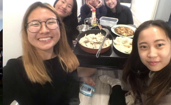
Dumpling night We made our own dumpling