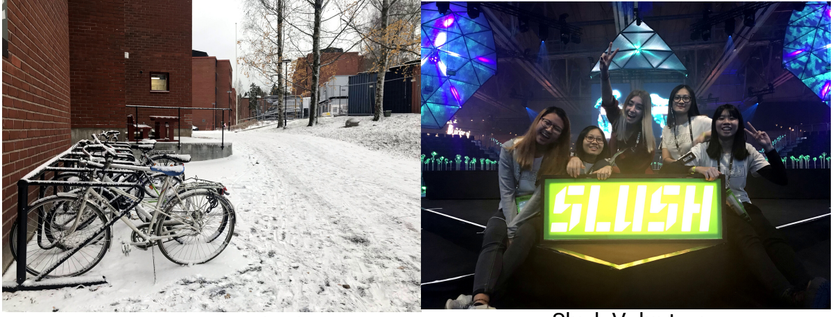
First snow in Helsinki

The last month in Aalto. Apart from working hard for the course project, it was also time to farewell to other exchange students. My friend came to Finland and we started our one-month traveling.