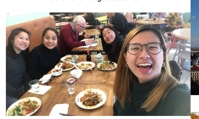
Travel to Budapest

Chinese restaurant lunch with other exchange students